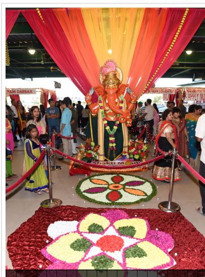
Giant red Lord Ganesha seated at the entrance. In front is the elaborate flower rangoli.