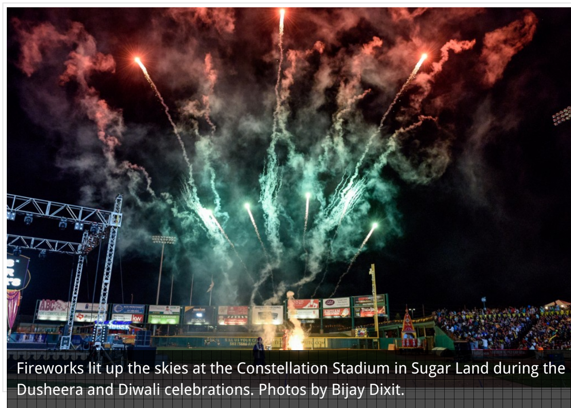
Fireworks lit up the skies at the Constellation Stadium in Sugar Land during the Dusheera and Diwali celebrations.

An event of such a magnitude takes a whole year of planning and the host organizers; Sri Suta Ram Foundation is already getting a head start on 2017. The play Ram Leela will be presented on Sunday, November 6th at 3pm at the Stafford Centre.